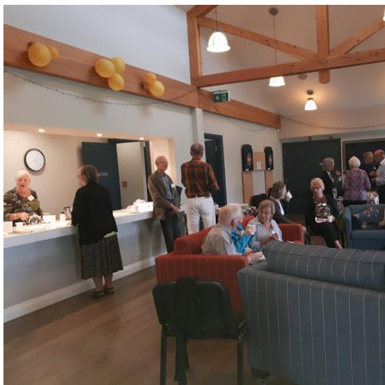
Meeting in the pleasant lounge at Summerset Retirement Village

U3A depends on them and we are very grateful.