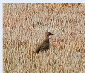
Not a clear photo, but this was the Banded Rail looking anxiously around for danger.