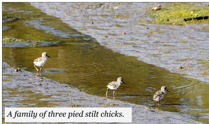
A family of three pied stilt chicks.