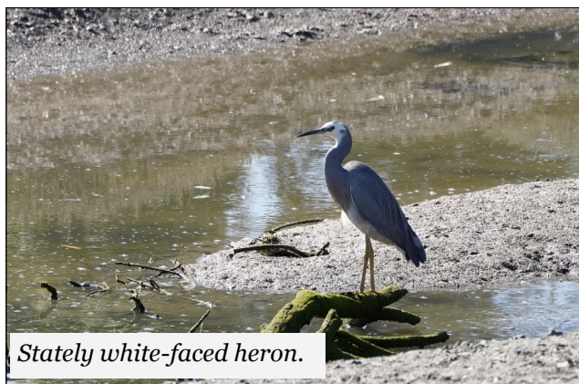
Stately white-faced heron.

Photos taken at the airport pond in November.