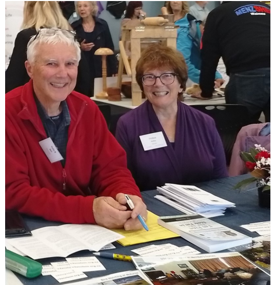
These are some of the cheerful volunteers who looked after our stall on the day