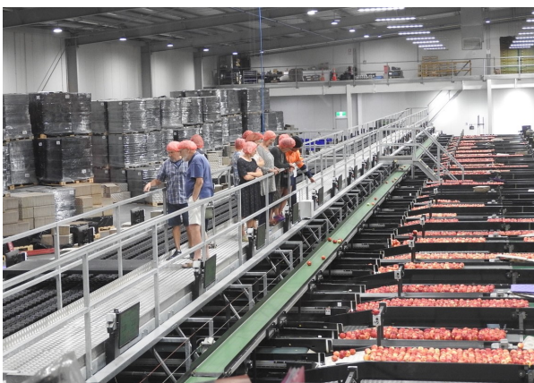
Inside the packhouse.