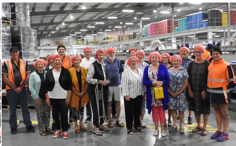
The group resplendent in their hairnets!