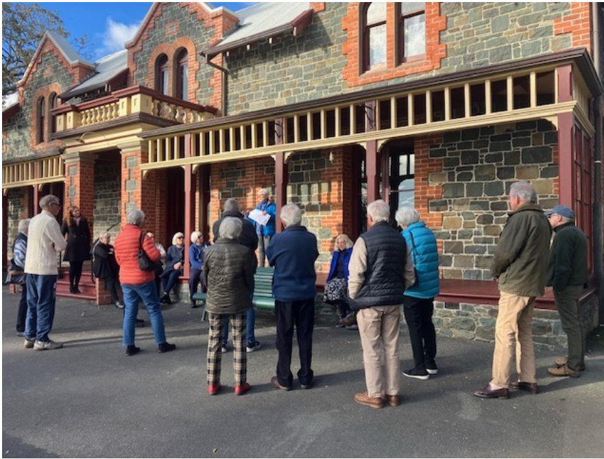
All ready to enjoy a tour of Isel House.