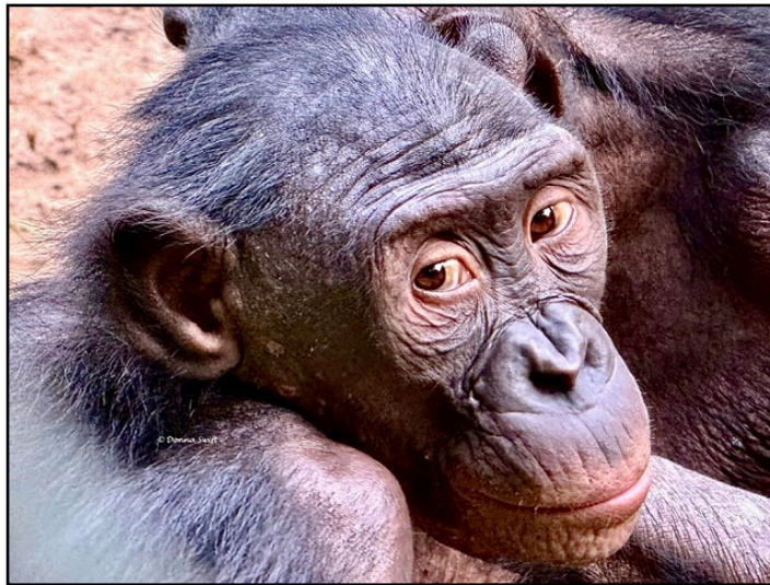
Bonobo Lola Ya